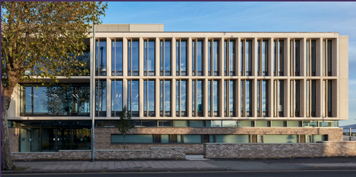
Autism West Midlands Head Office