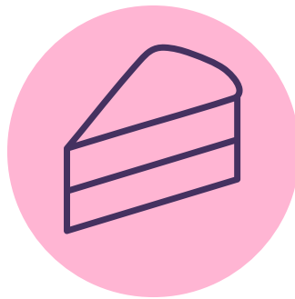
Colourful cake sale