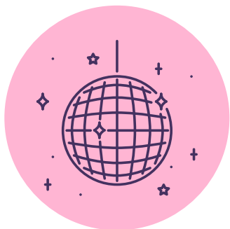
End of term school colour disco