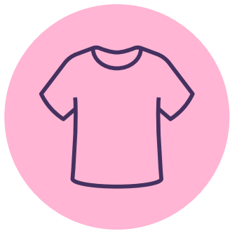
Rainbow non-school uniform day