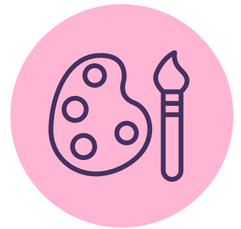
School art exhibition