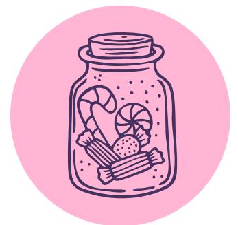
Guess the Sweets in the Jar